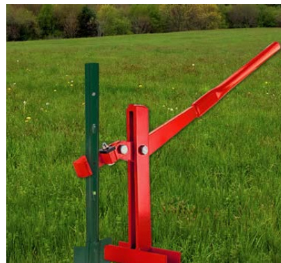
Post puller for U post uninstalling