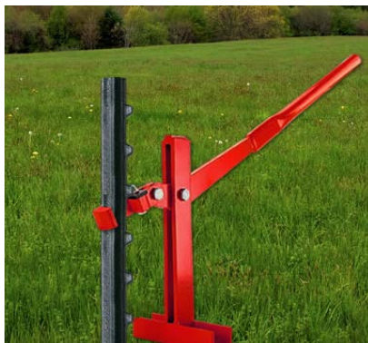
Post puller for T studded post uninstalling