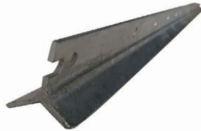
Y post without teeth