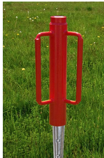
Post driver for vineyard post installing