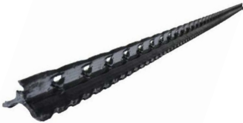
Y post with teeth