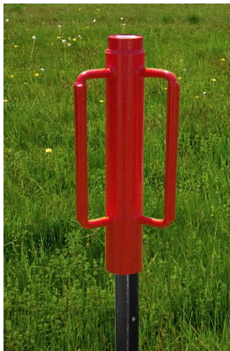
Post driver for Y post installing