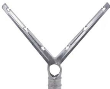
V barb arm