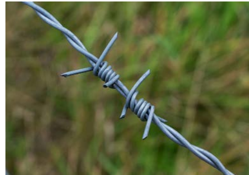
Double strand barbed wire