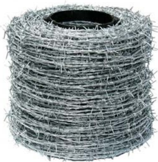
Galvanized barbed wire