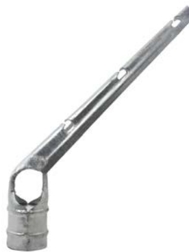
45 degree barb arm