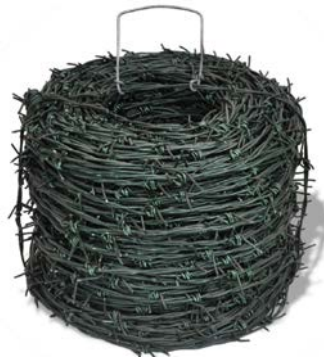
PVC coated barbed wire