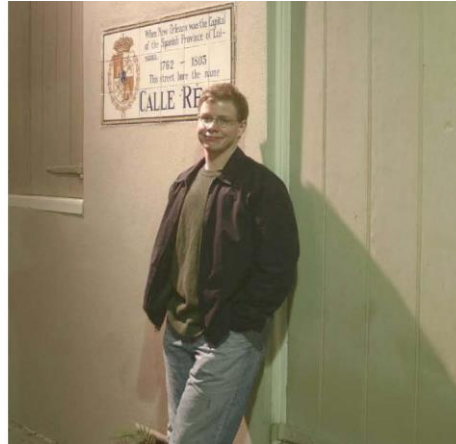
Pre-transition 5'10" ~ 125kg Post-transition ~ 85kg